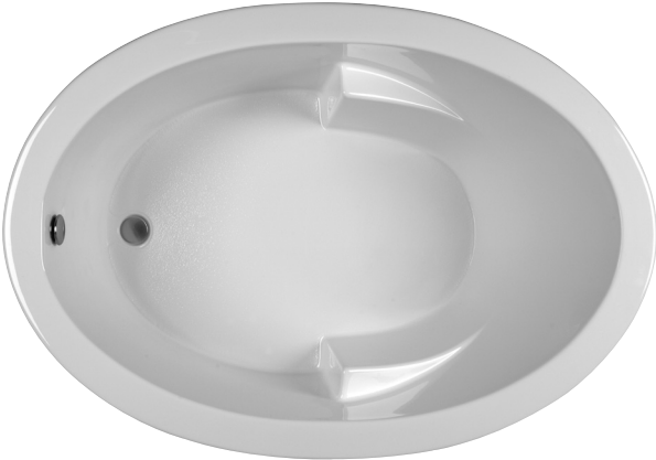
Features integral armrests. Shown with optional textured bottom.