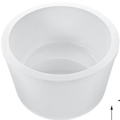
Features integral seat