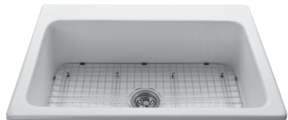
Optional sink grid shown above.

Large Sink Grid - Sold individually. (MBLSG)