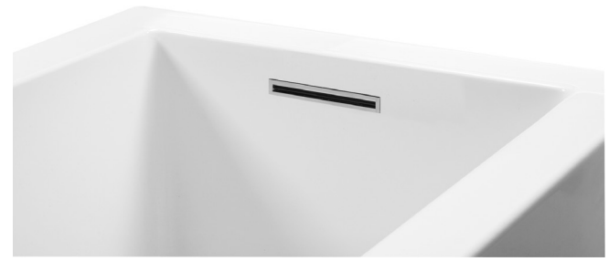
Must be specified when the tub is ordered. Available for select Designer Collection tubs only.

Sleek low profile overflow is factory installed \, \cdot \, Overflow measures 4.5" x 1" Provides a deeper soak \, \cdot \, Not available for commercial applications