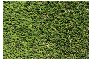
EMERALD GREEN ARTIFICIAL TURF 110oz LTRFREME15X100-45MM110OZ