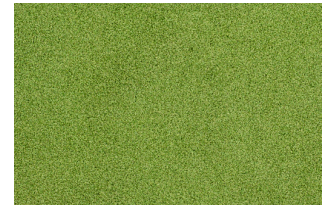
ARTIFICIAL PUTTING GREEN TURF LTRFRPUG15X100-16MM78OZ