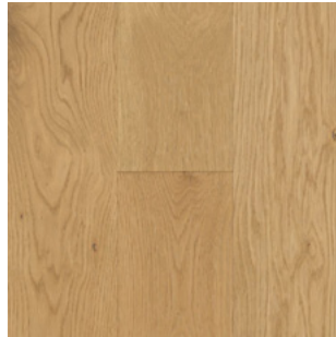
CHEYENNE OAK BCE02-34