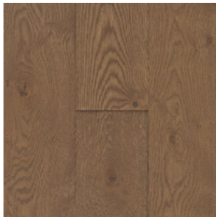
BLAZE OAK BCE02-37