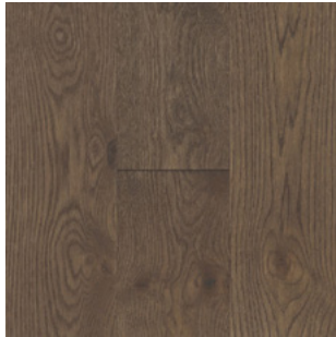
UMBER OAK BCE02-33