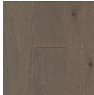
CREEK BEND OAK BCE02-39