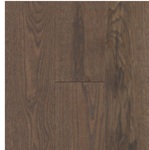
SACHEL OAK BCE02-35