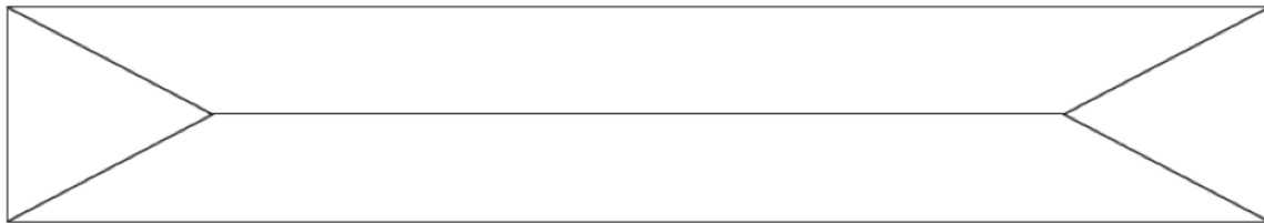
Score Tile As Shown