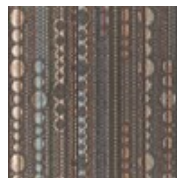
7968 Smoky Martini