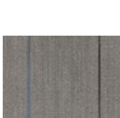
358 Thrill Seeker