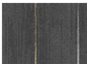
999 Leather Jacket