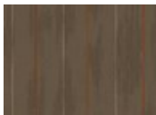
862 Tough Guy