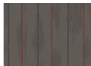
955 Cool Hand