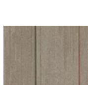
152 Living Fast