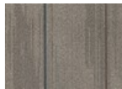
859 Glory Days