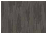
983 Roust About