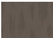
358 Thrill Seeker