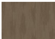
152 Living Fast