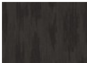
999 Leather Jacket