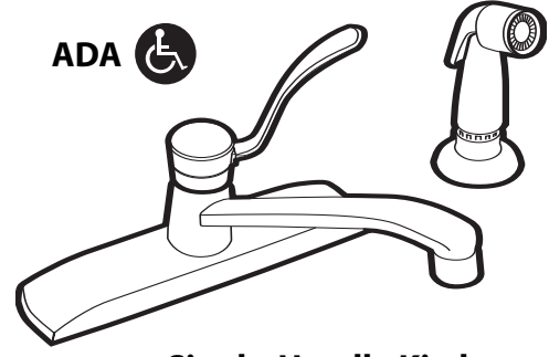
Single-Handle Kitchen Faucet w/Hose & Spray

Warranted for 5 years against material or manufacturing defects