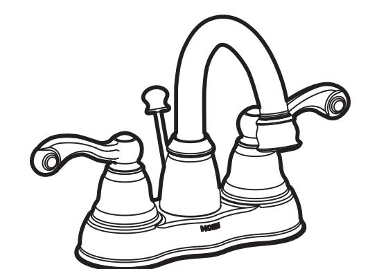
Traditional Two-Handle Lavatory Faucet