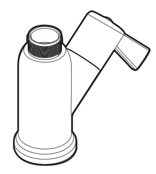
Single-Handle Laboratory Faucet