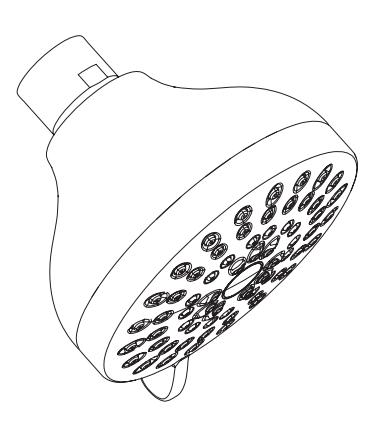
Adler™ 4-Function Showerhead