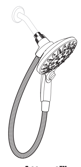
Attract™ 6-Function Handshower with Magnetix™ Docking and Hose

Visit www.moen.com/support for complete details and limitations