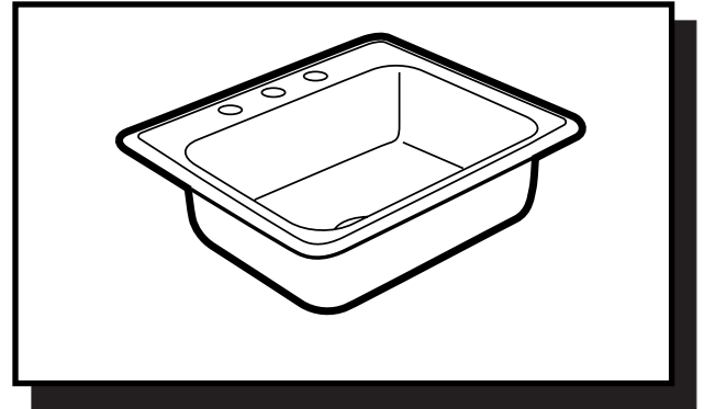
Camelot® Single Bowl Kitchen Sink Model: 22223 (K-2522-3)