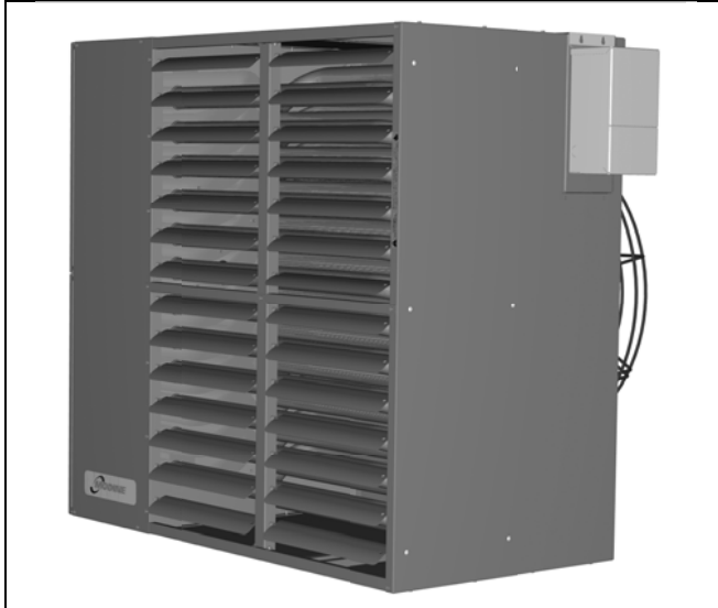
Model PTS with Transformer Accessory Mounted