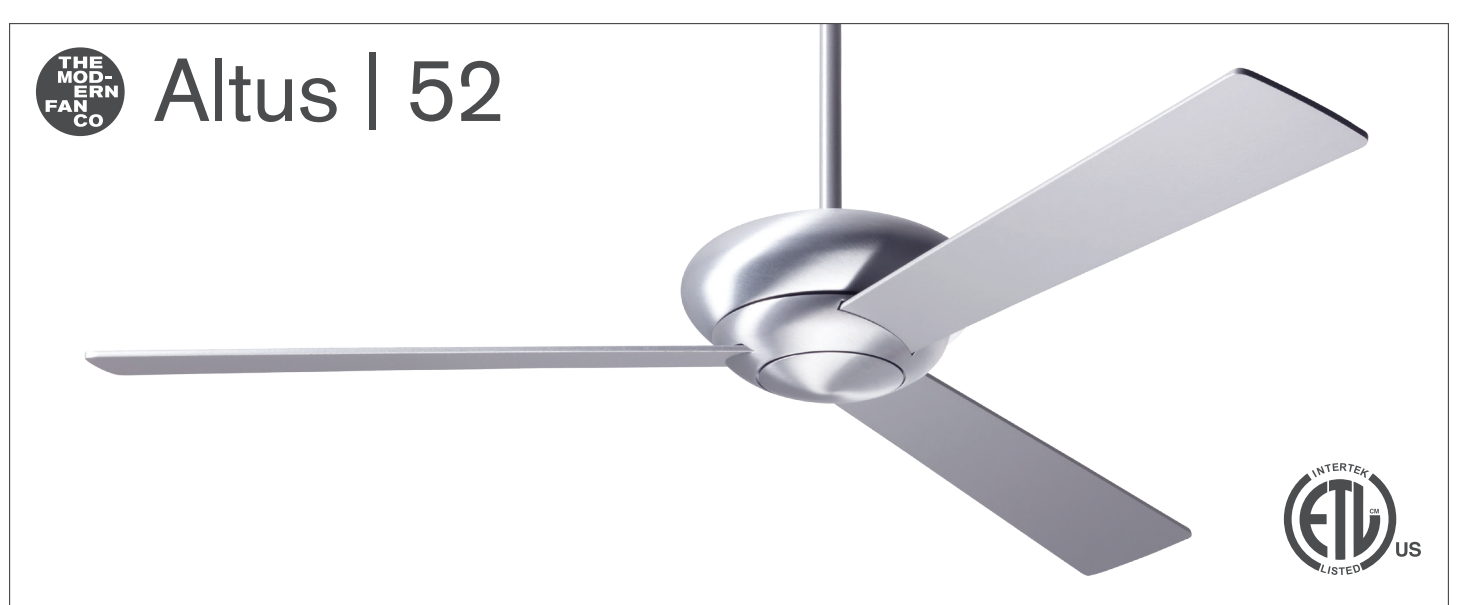
Altus \mid 52 \ > \ {\tt Configure\ item\ number\ from\ attributes\ below}.