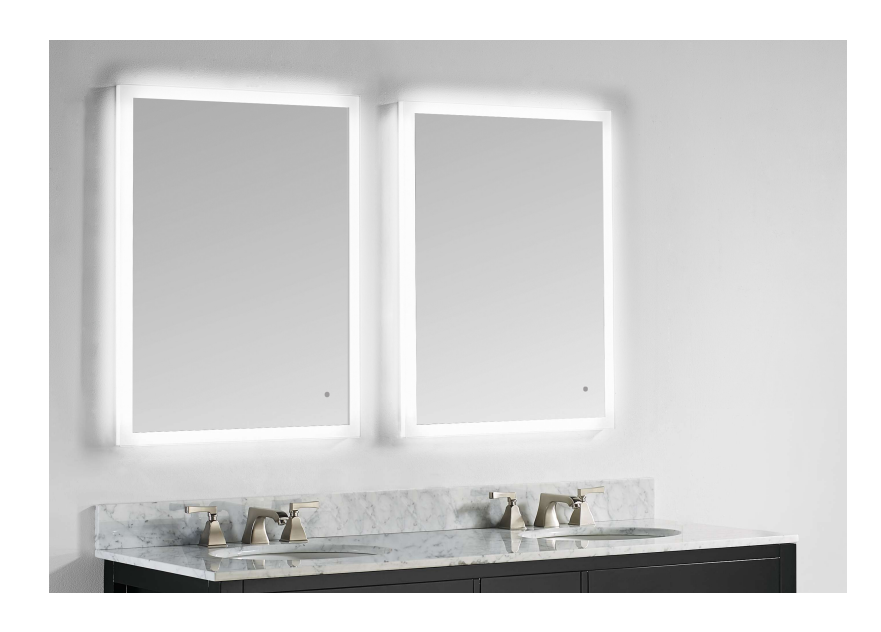
(Items other than the mirror shown in the picture above are not included)