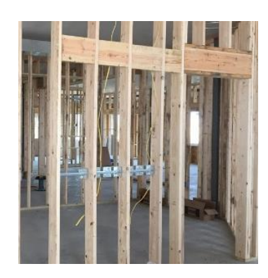
New Construction Header Example