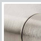
SATIN NICKEL (MH-xHOW-SN)