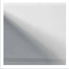
WHITE ENAMEL (MCI98-0UM-20)