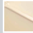
BISCUIT ENAMEL (MCI98-0UM-22)