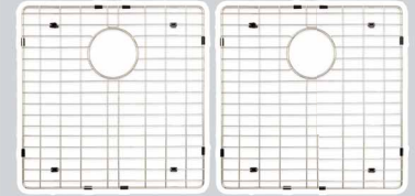
Basin Rack Set 744-STC