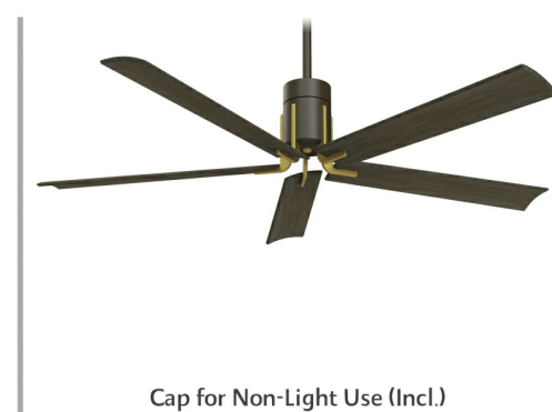
Cap for Non-Light Use (Incl.)