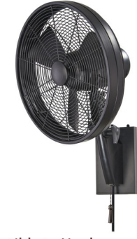
Convertible to Hardware or Wall Plug