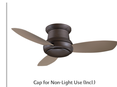
Cap for Non-Light Use (Incl.)