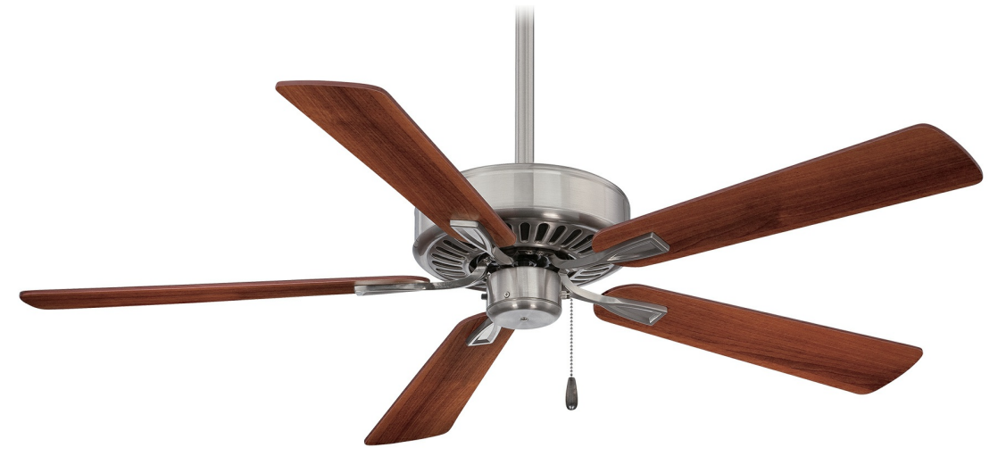
Shown with Reversible Dark Walnut Blades