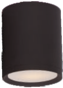
DS 86104 ABZ, AL Flush Mount B