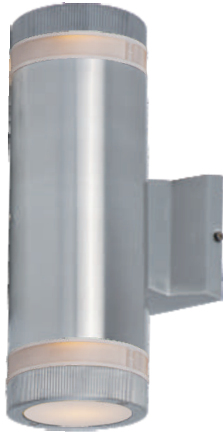
86112 ABZ, AL Wall Sconce