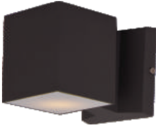
DS 86107 ABZ, AL Wall Sconce D