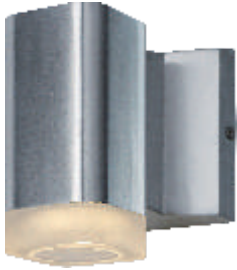
DS 86131 ABZ, AL Wall Sconce