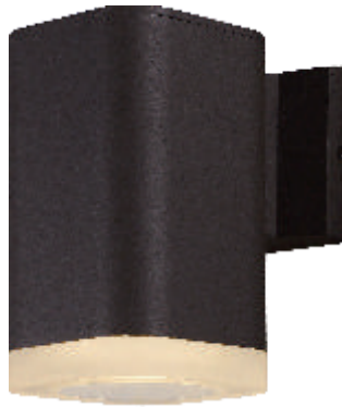
DS 86137 ABZ, AL Wall Sconce