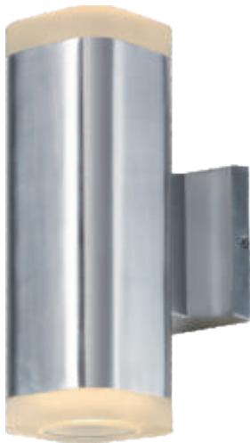
86135 ABZ, AL Wall Sconce