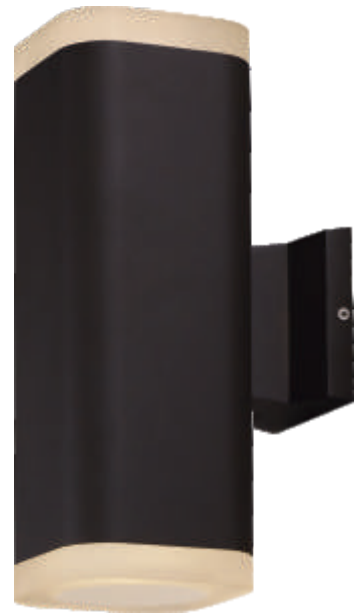
86138 ABZ, AL Wall Sconce