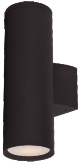
86102 ABZ, AL Wall Sconce