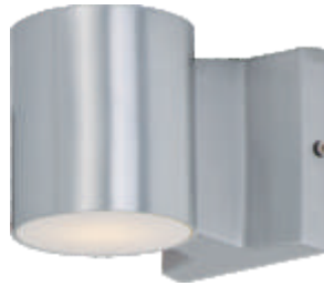
DS 86106 ABZ, AL Wall Sconce C