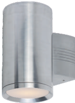
86101 ABZ, AL Wall Sconce A