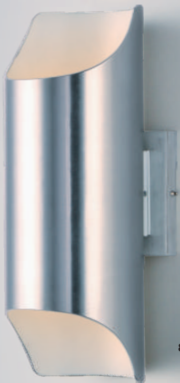
86119 ABZ, AL Wall Sconce A