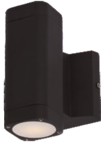
DS 86109 ABZ, AL Wall Sconce F