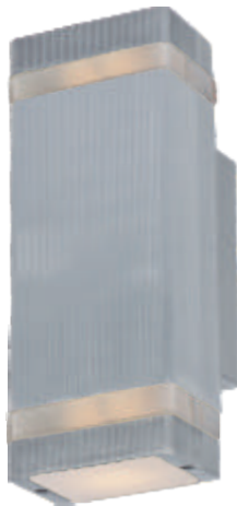
86129 ABZ, AL Wall Sconce