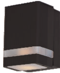
DS 86128 ABZ, AL Wall Sconce