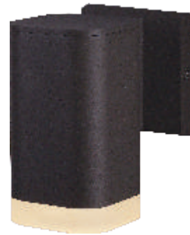
DS 86134 ABZ, AL Wall Sconce