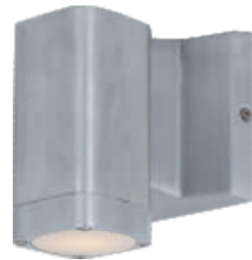
DS 86108 ABZ, AL Wall Sconce E