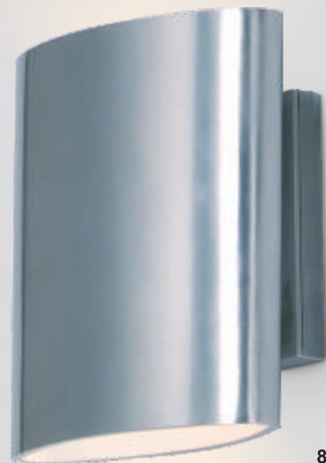
86152 ABZ, AL Wall Sconce B