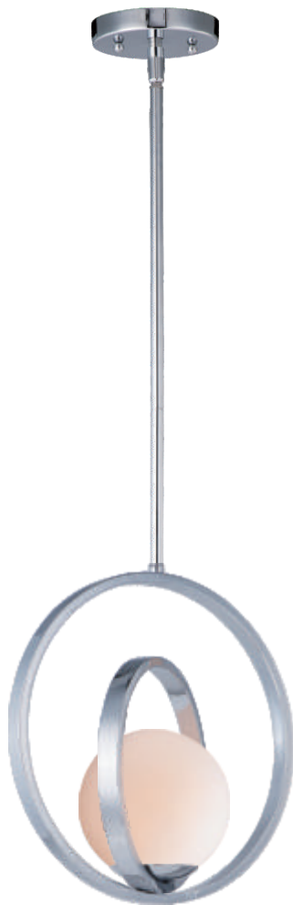
26052 SWPC, SWSBR Pendant