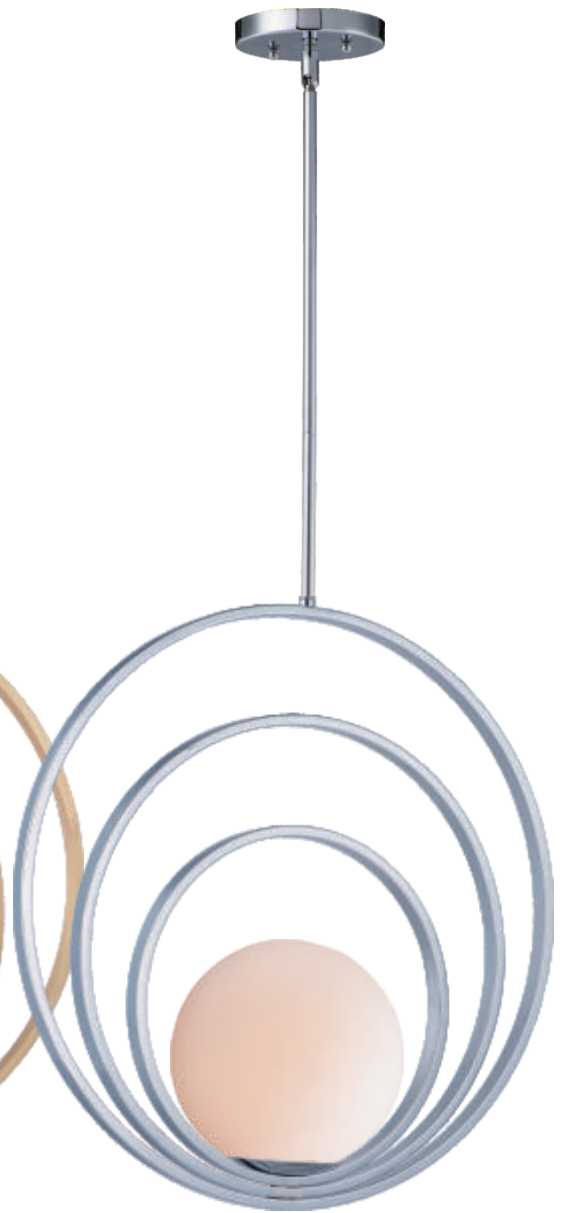
26056 SWPC, SWSBR Pendant