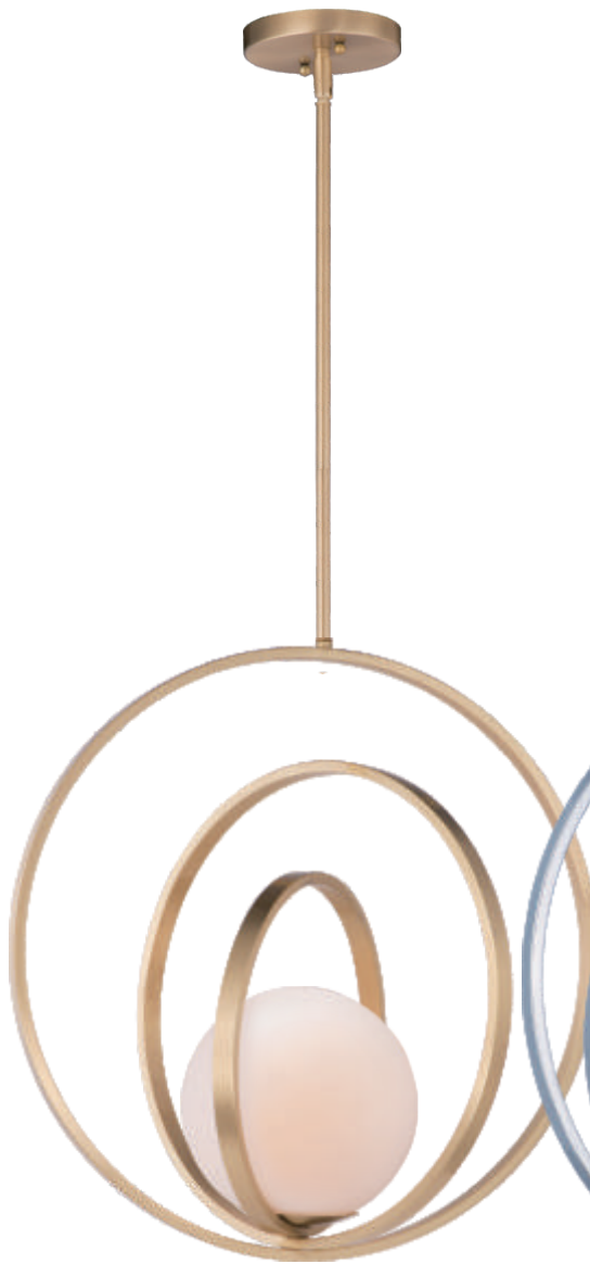
26054 SWPC, SWSBR Pendant