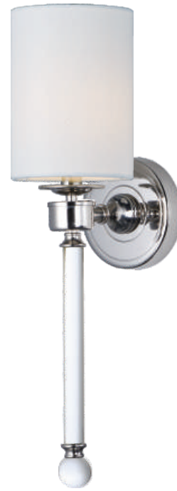
16109WTCLPN Wall Sconce