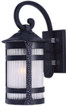
3125CONAR Casa Grande 1-Light Outdoor Wall