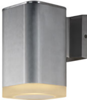
86137AL Lightray LED Wall Sconce