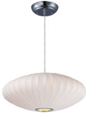
12190WTPC Cocoon 1-Light Pendant