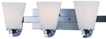
9013SWPC Conical 3-Light Bath Vanity