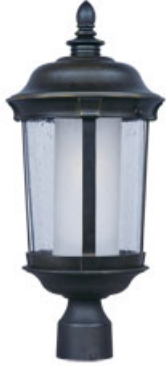
86592CDFTBZ Dover EE 1-Light Medium Outdoor Pole/Post Lantern