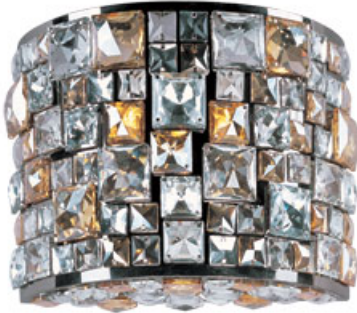
39798JCLB Fifth Avenue 3-Light Wall Sconce