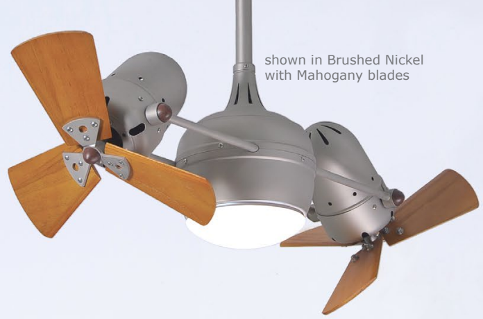
shown in Brushed Nickel with Mahogany blades