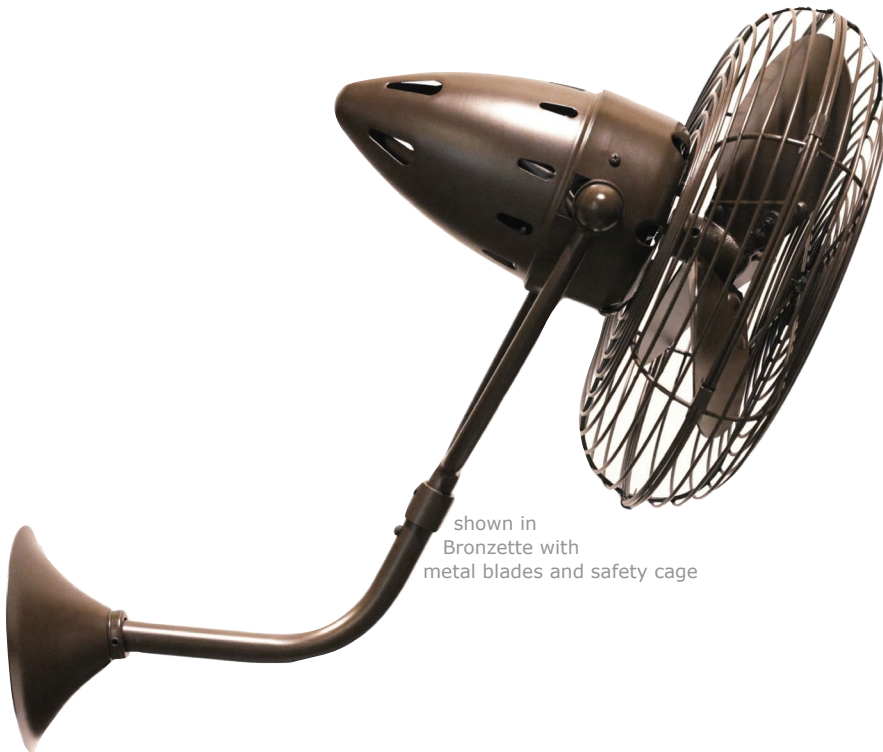
shown in Bronzette with metal blades and safety cage