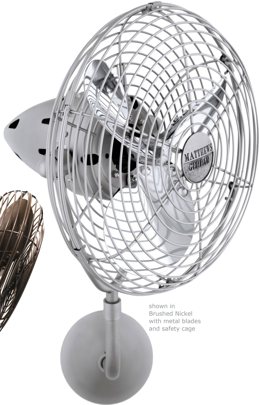
shown in Brushed Nickel with metal blades and safety cage

The Brunna Parede is reminiscent of the wall fans of the early 20th century. The fan head of the Brunna Parede wall mounted fan can be infinitely positioned vertically and horizontally across 180-degree arcs to provide maximum directional airflow. It can be mounted in small, awkward spaces or in front of HVAC ducts to make more efficient the heating, ventilation or air conditioning of any space. Constructed of cast aluminum, heavy spun and stamped steel, the Brunna Parede carries a limited lifetime warranty.