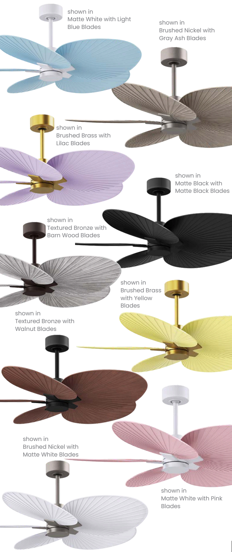
shown in Matte White with Light Blue Blades