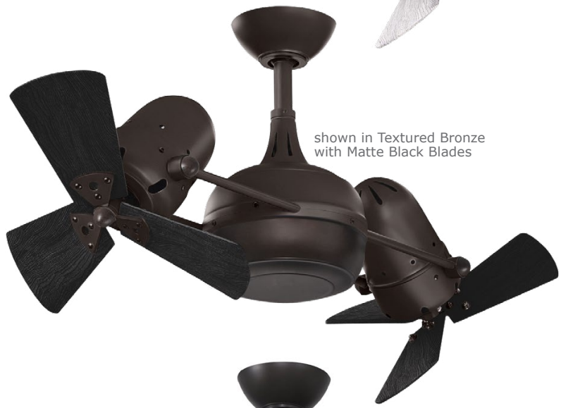
shown in Textured Bronze with Matte Black Blades