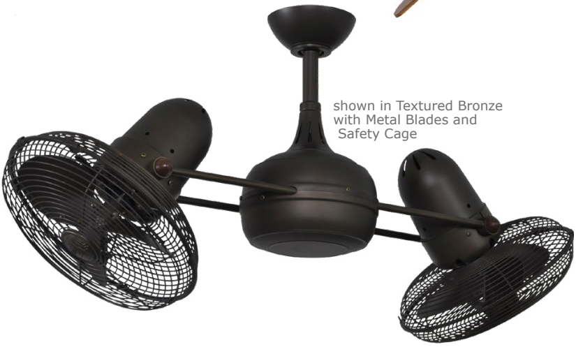
shown in Textured Bronze with Metal Blades and Safety Cage