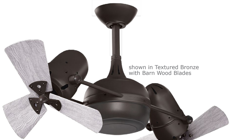
shown in Textured Bronze with Barn Wood Blades