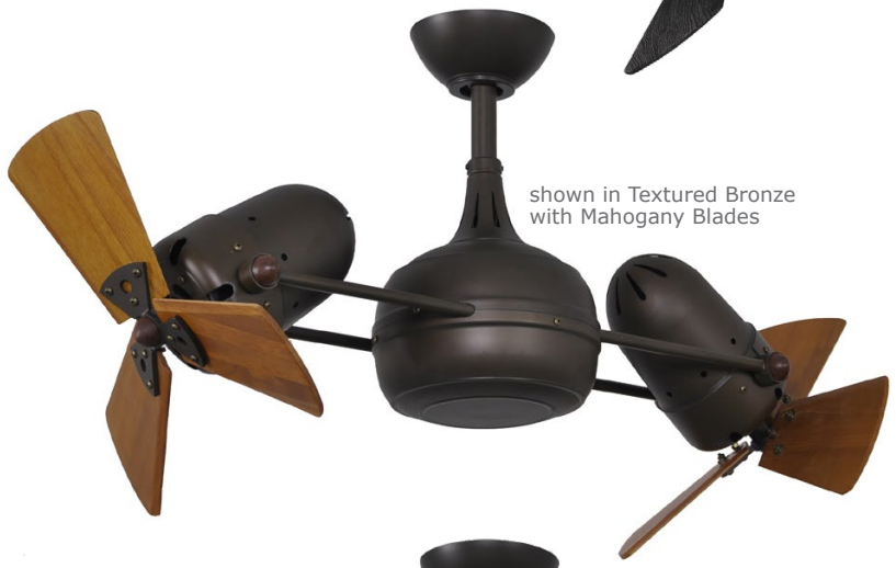
shown in Textured Bronze with Mahogany Blades