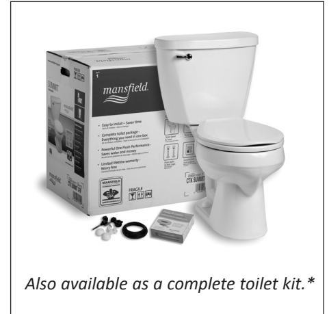
Also available as a complete toilet kit.*