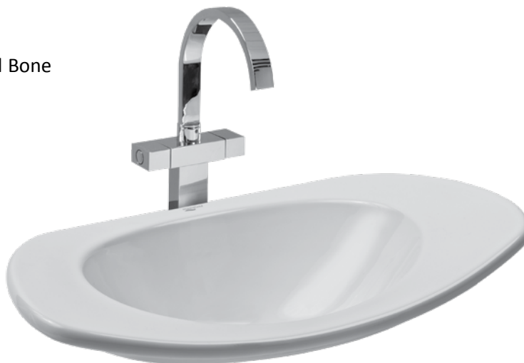
Model 826 (Less faucet, drain assembly and supply)