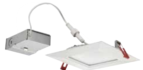
6" Wafer LED Downlight