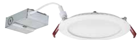
4" Wafer LED Downlight