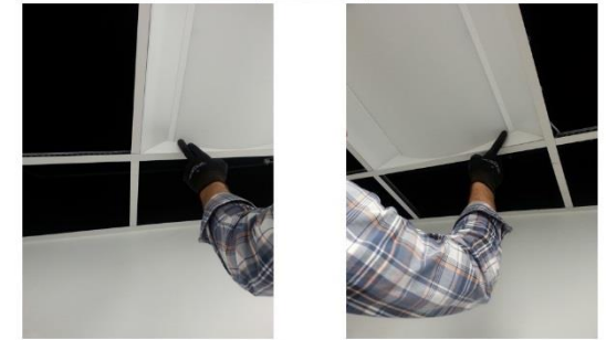
Using one finger, depress the corners of the lens where the lens meets the rails. Locate the side that does not contain spring clips. This side will depress easier than the side containing the clips.