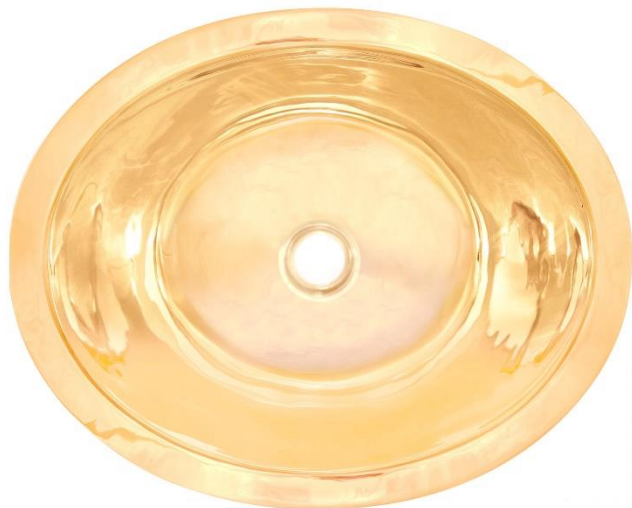
Shown in PB

Linkasink warranties our product to be free from manufacturing defect for the life of the product. Warranty does not cover improper care, neglect, abuse, or normal wear-and-tear.