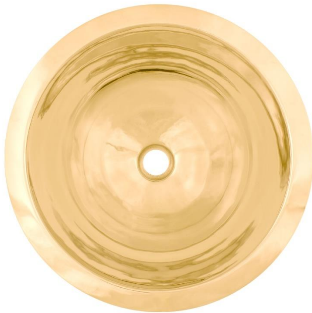
Shown in PB

Linkasink warranties our product to be free from manufacturing defect for the life of the product. Warranty does not cover improper care, neglect, abuse, or normal wear-and-tear.