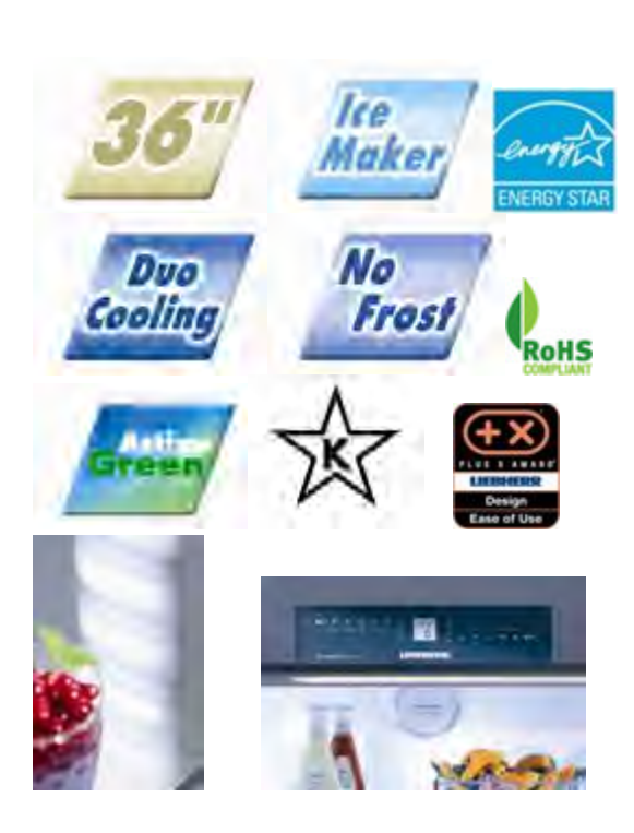
LED light column Digital Display

The Duo Cooling system with two separate variable speed compressors for the refrigerator and the freezer provides a superior cooling performance as well as maximum energy efficiency.