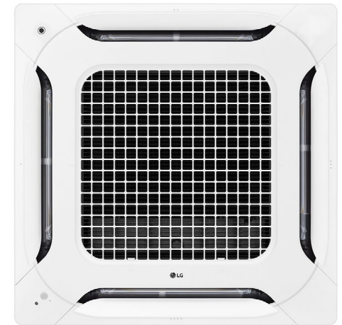
Vanes Fully Opened