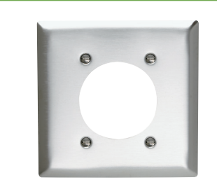
Power Outlet Receptacle Opening, Stainless Steel (SS703)