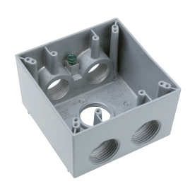
Weatherproof Box for Outdoor Mounting (WPBD452)