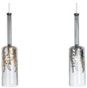
clear with gold clear with silver